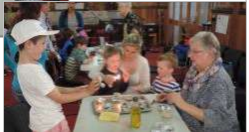
Above & right: Messy Christmas