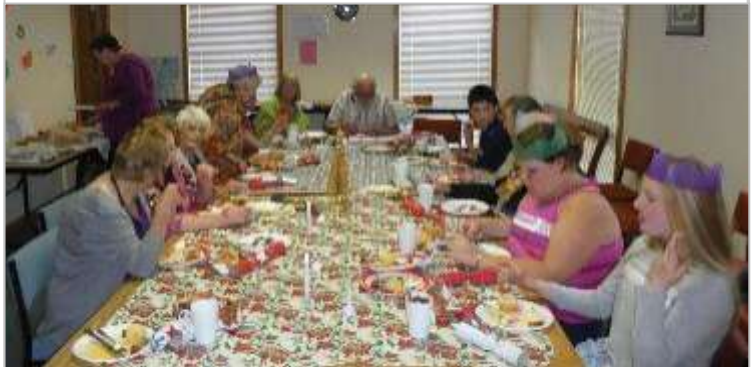
Below: Fellowship Night Christmas